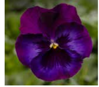
Delta™ Pro Neon Violet