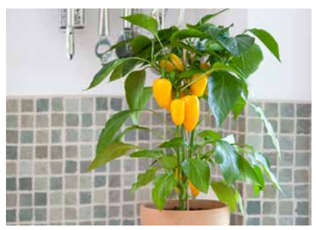
Pepper Fresh Bites Yellow

Garden Height: 12-14" Garden Spread: 8-10" Containers: 4-8" Pots