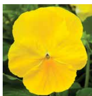
Delta<sup>™</sup> Pro Clear Lemon

Rose with Blotch Violet & White White with Blotch Yellow with Blotch Yellow with Red Wing All Colors Mix Blotch Mix Citrus Mix Citrus Mix Clear Colors Mix Cool Waters Mix Tricolor Mix