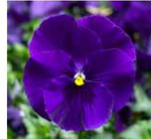
Delta<sup>™</sup> Classic Deep Blue