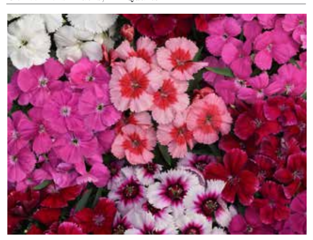
Coronet<sup>™</sup> F1 Mix Improved

Garden Height: 8-10" Garden Spread: 8-10" Containers: Packs, 4"- Quarts