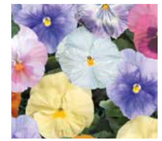
Delta<sup>™</sup> Classic Monet Mix