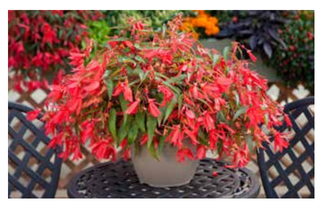
Bossa Nova ^{\mathsf{TM}} Rose Improved

Containers: 4-6" Pots, 1-3 Gallon Baskets