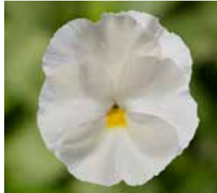
Delta™ Pro Clear White