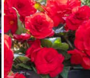
Limitless™ Dark Red