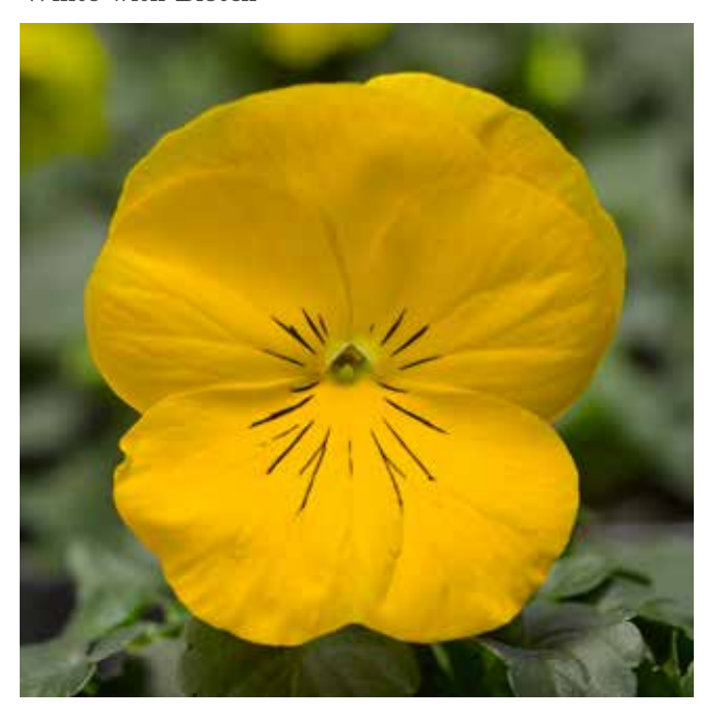
Delta<sup>™</sup>Speedy Clear Yellow Improved