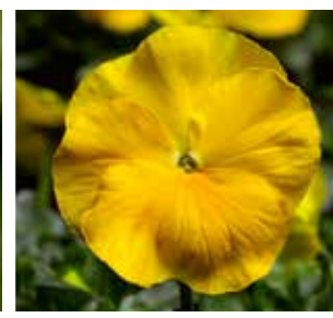
Delta™ Pro Clear Yellow