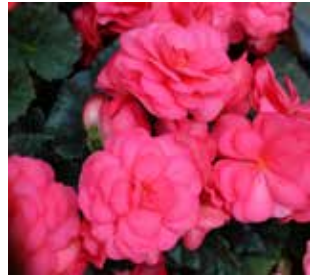
Limitless<sup>™</sup> Dark Rose