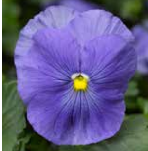
Delta<sup>™</sup> Pro Clear True Blue