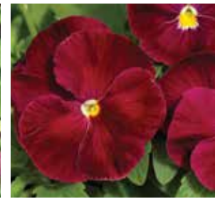
Delta™ Classic Pure Rose