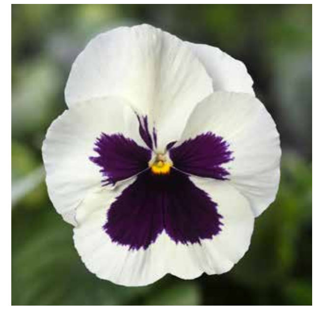
Delta<sup>™</sup>Speedy White w/Blotch