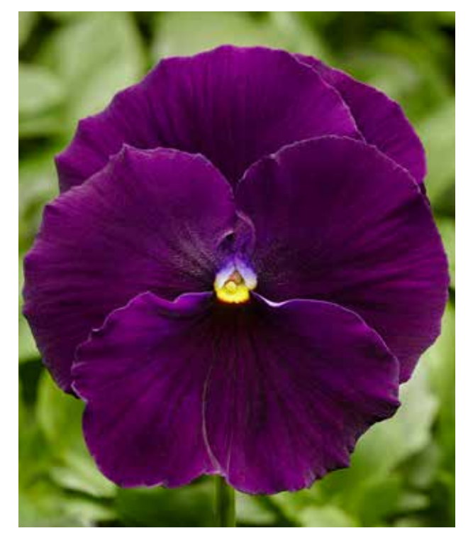
Delta™ Pro Clear Violet