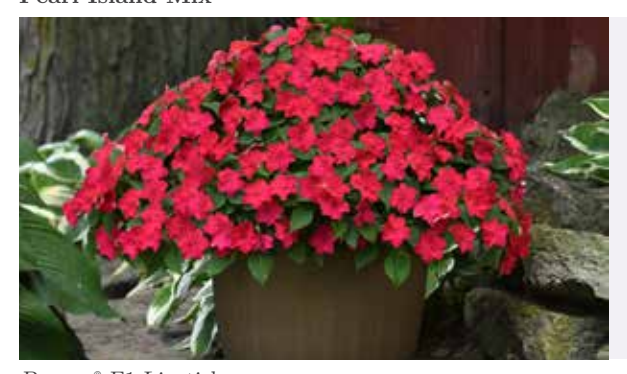
Beacon® F1 Lipstick