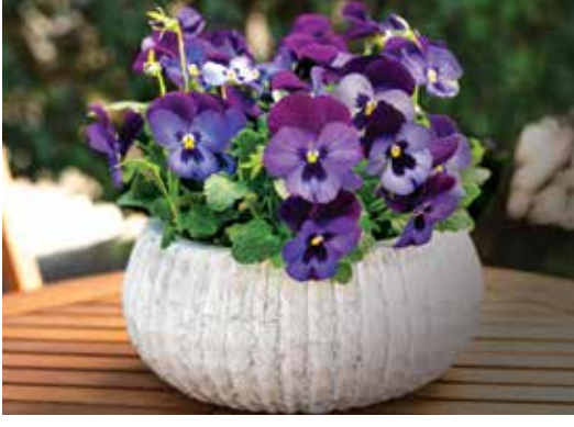
ColorMax F1 Blue Jeans