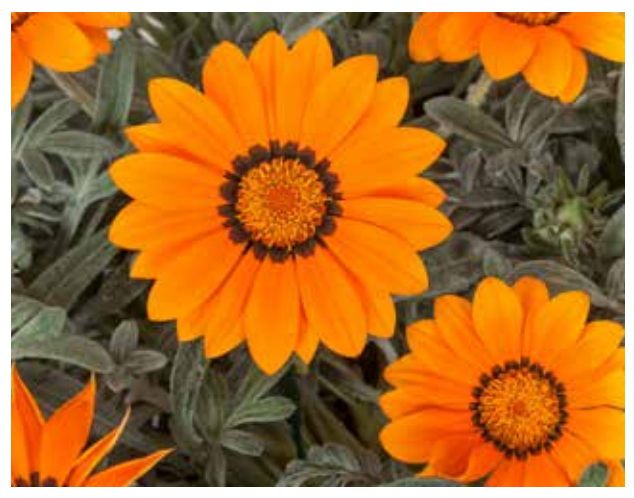
Kiss<sup>™</sup> Frosty Orange Improved