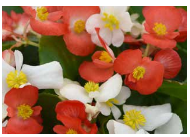
Hula<sup>™</sup> Red & White Mix

Containers: 306/1801 Packs, 4-6" Pots, Quarts, Gallons, Baskets