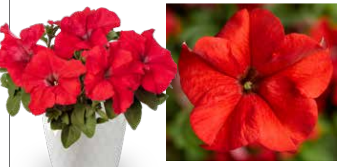
Duvet<sup>™</sup> F1 Red Improved

Containers: Packs, Pints, Quarts - 1 Gallon