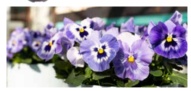
Delta™ Classic Marina