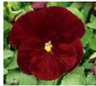
Delta<sup>™</sup> Classic Pure Red