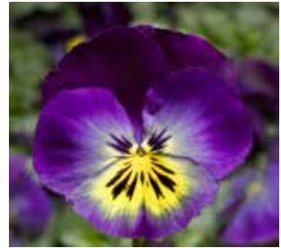
Delta™ Classic Blue Morpho