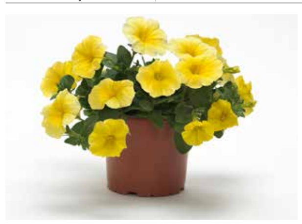
Caliburst<sup>™</sup> F1 Yellow