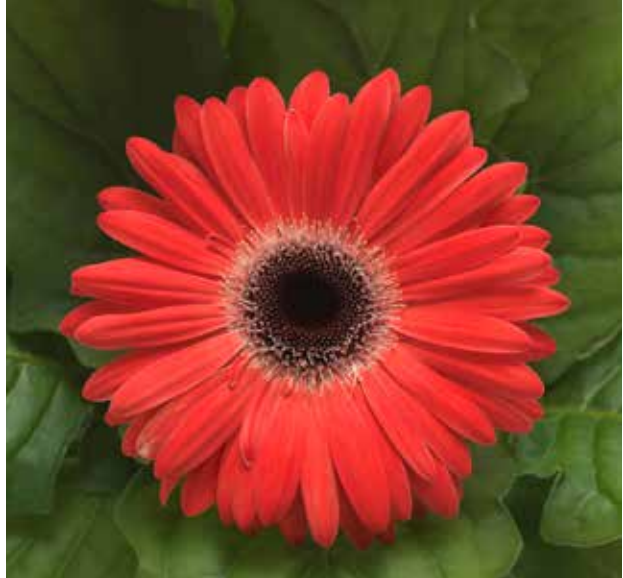
ColorBloom F1 Watermelon with Dark Eye