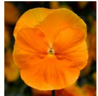
Delta<sup>™</sup> Pro Clear Orange