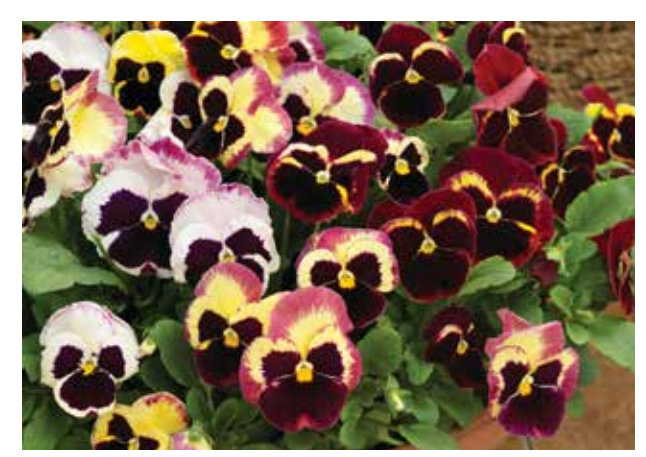
Delta<sup>™</sup> Classic Tapestry