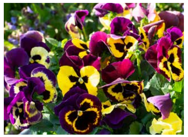
Delta<sup>™</sup> Classic Yellow w/Purple Wing