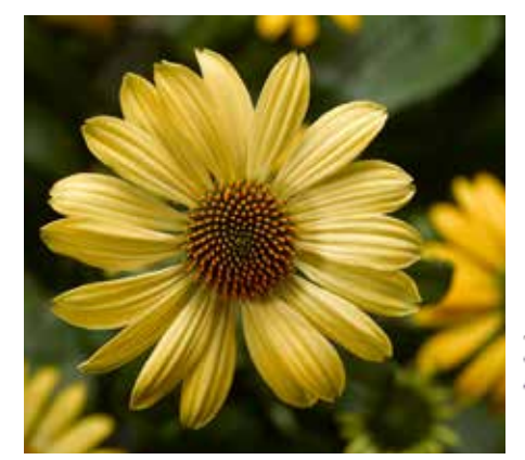
Prairie Blaze Golden Yellow