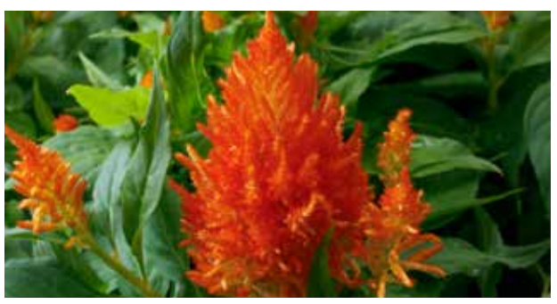
Flamma Orange AAS