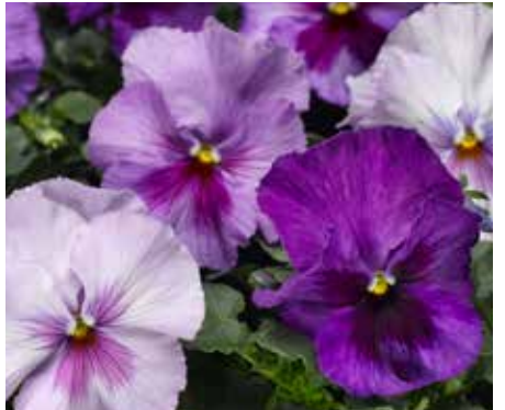
Delta<sup>™</sup> Pro Lavender Blue Shades