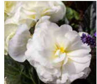
Limitless<sup>™</sup> Cream Shades