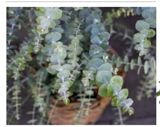
Baby Blue Bouquet

Form: ASTD Garden Height: 50" Containers: Cut Flower