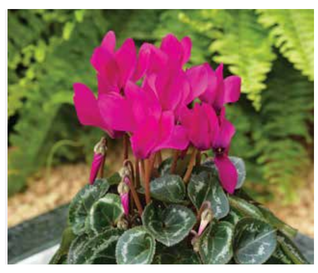
Winfall<sup>®</sup> F1 Purple Imp