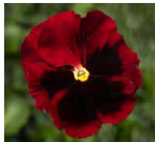
Delta<sup>™</sup> Pro Red w/Blotch