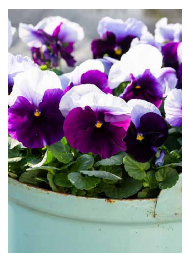
\mathrm{Delta}^{^{\mathrm{TM}}} Classic Beaconsfield

Yellow with Purple Wing Apple Cider Mix Berry Tart Mix Blaze Mix Buttered Popcorn Mix Cotton Candy Mix Monet Mix Watercolors Mix Wine & Cheese Mix