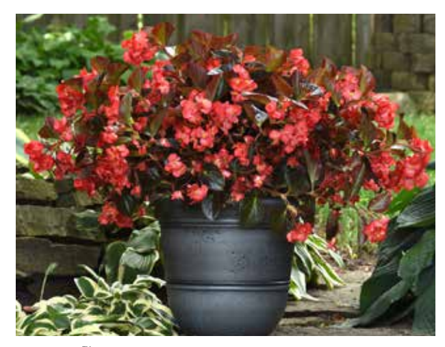
Megawatt<sup>™</sup> F1 Red BL