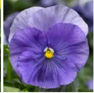
Delta™ Pro Clear Light Blue