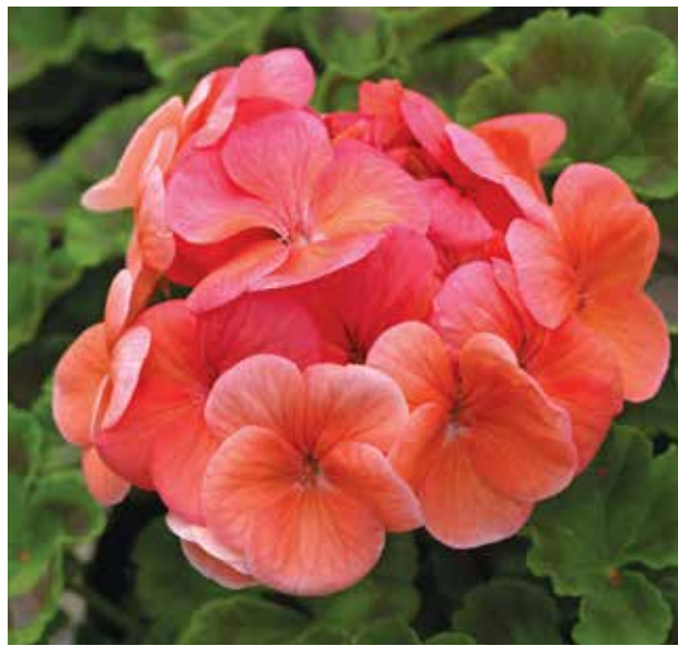
Pinto<sup>™</sup> F1 Premium Deep Salmon