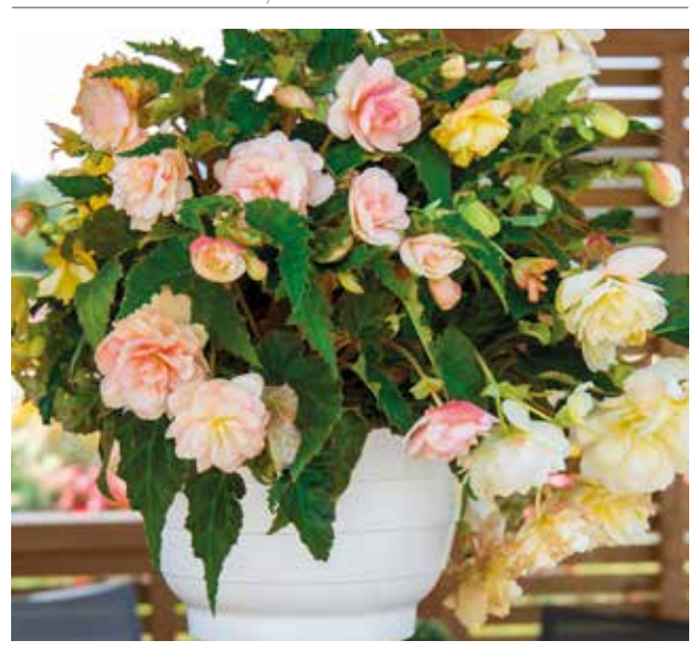
Nonstop Joy Peaches & Dreams

Garden Height: 10-12" Containers: 4-6" Pots, Baskets