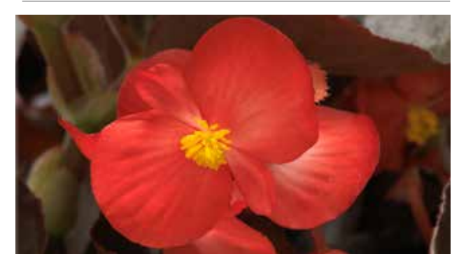
Baby Wing® Red BL

Garden Height: 12-15" Garden Spread: 10-12" Containers: Quarts-Gallons