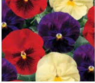
Delta™ Classic Watercolors Mix Delta™ Classic Wine & Cheese Mix