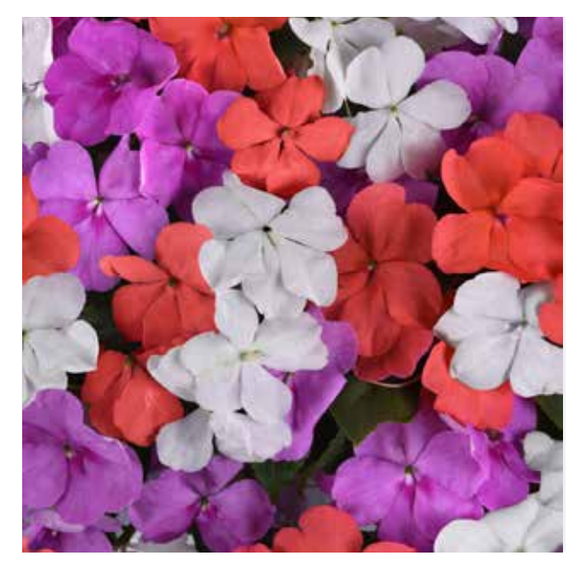
Beacon<sup>®</sup> F1 Pearl Island Mix